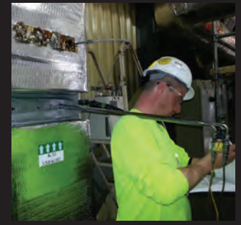
TOP: Assistance with Title V air permitting and compliance, as well as water and waste compliance at this steel plant in Michigan serving the automotive, construction, and appliance markets.